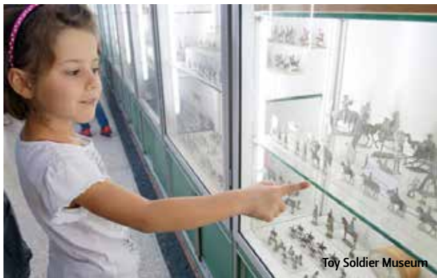
Toy Soldier Museum

Weather permitting, it is worth it to go to the park of the Margherita Gardens, at the edge of the town centre. In the park there is an artificial pond with fish and ducks and in the warmer time of the year visitors can take boat trips; at the centre of the park there is a chalet, a resting place for visitors. There are also fully-equipped playing areas for children, including a carousel, a beautiful recreation ground, immense lawns where children can run and a small area for treasure hunting: searching for the Villanovan hut, a reproduction made by the Archaeological Museum of the old huts built from straw, earth and wood, where the local inhabitants used to live 2,800 years ago.