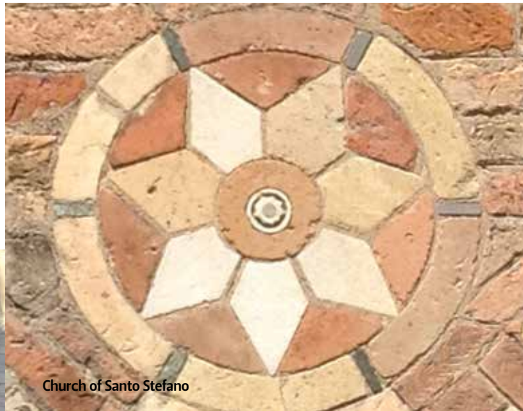
Church of Santo Stefano