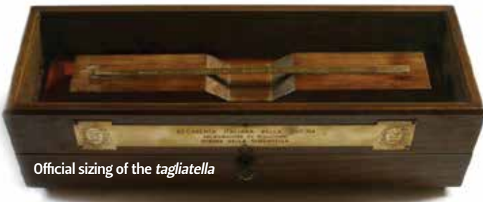
Official sizing of the tagliatella

Since the end of the XIV century until the end of the XVII century the Palazzo della Mercanzia di Bologna, also known as Loggia dei Mercanti or Palazzo del Carrobbio, hosted the Universitas mercatorum (merchants’ academy) and also the seat of some local guilds. From 1797 on, with the French occupation it became the seat of the Chamber of Commerce. From 1972 on inside its premises was put on display a golden template of the authentic Bolognese noodle (Tagliatella bolognese) whose width equals the 12,270th part of the Asinelli Tower. This is a typical local example of the procedure applied internationally to define standard units of measurement.