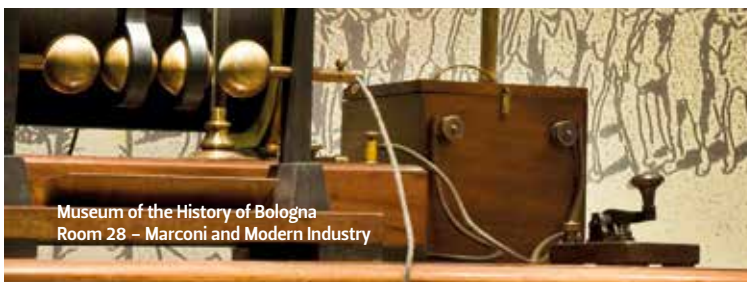
Museum of the History of Bologna Room 28 – Marconi and Modern Industry