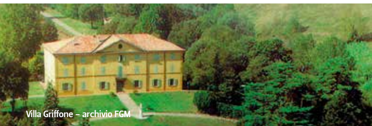
Villa Griffone

Main residence of the Marconi family since mid-19th century. In Villa Griffone Guglielmo Marconi set up his first workshop and completed his first experiments in wireless telegraphy (1895). The Mausoleum of Guglielmo Marconi beneath it was designed by the architect Marcello Piacentini. The entire complex is a national monument. At the scientist's death, in 1937, the villa became the seat of the Marconi Foundation, set up in 1938 to keep the memory of the great inventor alive. Integral parts of the asset of the foundation are the Library and the Archive with numerous Marconian funds. The Villa also houses the Marconi Museum, dedicated to the origins and development of radio communications. Historic machines, videos and interactive devices let the visitor retrace the events that characterized the formation, life and activity of the entrepreneur Guglielmo Marconi in the Company he founded in 1897. The park features sculptures which represent the great inventor and Marconian memorabilia. www.fgm.it