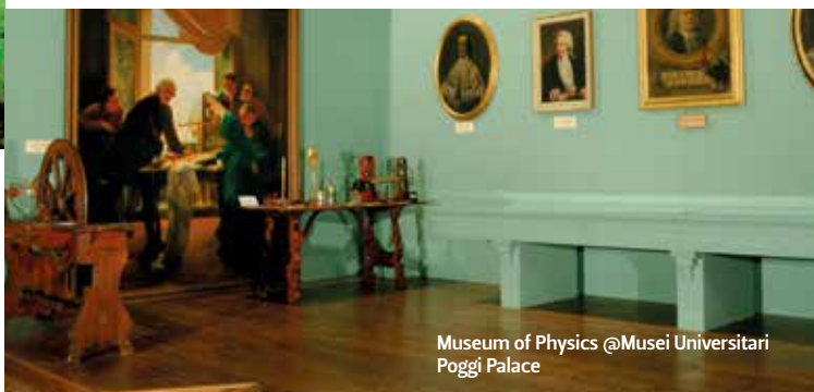
Museum of Physics @Musei Universitari Poggi Palace

In the first Bologna University building, which currently houses a city library, Guglielmo Marconi gave a speech in 1926 at the ceremony for the 30th anniversary of wireless telegraphy. www.archiginnasio.it