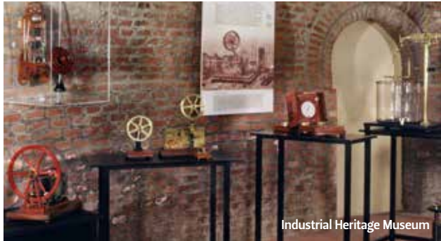
Industrial Heritage Museum