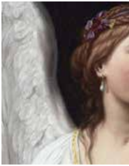
Sirani Elisabetta. An Allegory of Virtue (detail)

paintings surround the niche with the image of the Blessed Virgin Mary. The paintings were commissioned to famous painters from Bologna: Jesus among the Doctors is a work by Lavinia, as well as The coronation of the Virgin . She was called to Rome to work there and she stayed there until her death, in 1614. In 1665 the funeral of young Elisabetta Sirani was held in this basilica, she had died two months and a half before but she was buried only after long investigations. Elisabetta received a strict education from her father, the painter Giovanni Andrea, who prohibited her from leaving Bologna, maybe in order to get help in painting when he fell ill with arthritis. Elisabetta, an artist of rare sensitivity, surrounded herself with many female students who will continue the profession. She suddenly died after two days of excruciating agony and rumours started to circulate regarding a possible poisoning. She was buried together with Guido Reni in the Rosary Chapel.