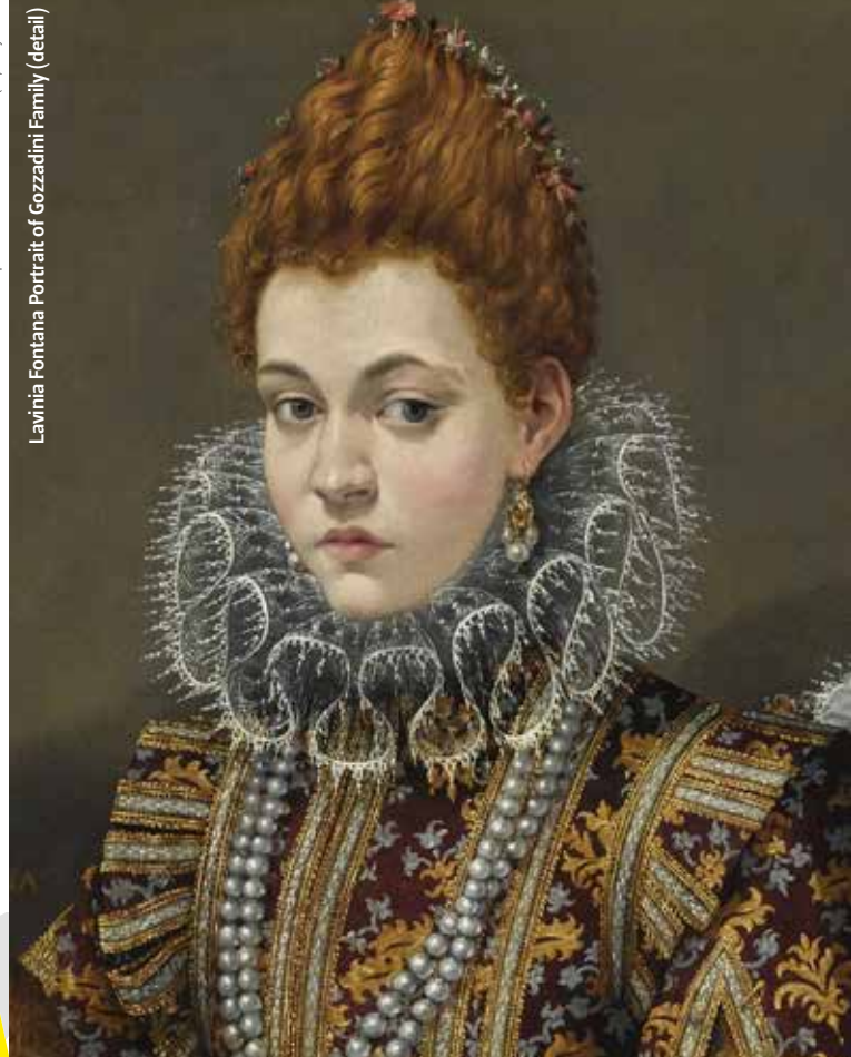
Lavinia Fontana Portrait of Gozzadini Family (detail)

stamps: kore srl - Piedimonte Metesio (CE) - July 2016