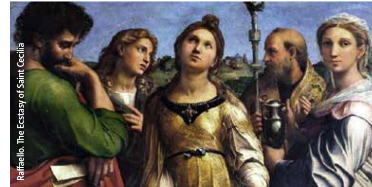
Raffaello. The Ecstasy of Saint Cecilia

Here is preserved the grave of Blessed Elena Duglioli (1472–1520). The Ecstasy of St. Cecilia by Raphael was made for her, now it is kept in the National Gallery of Bologna (Pinacoteca Nazionale di