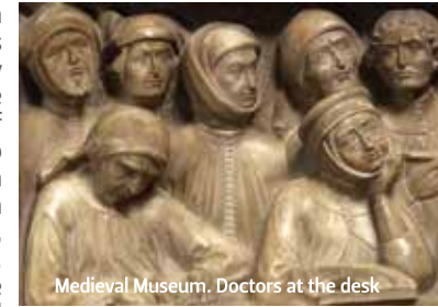
Medieval Museum. Doctors at the desk