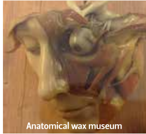
Anatomical wax museum

The University has a series of collections that over the years have been expanded and organized as the University Museum System comprising fourteen separate museums. Apart from Palazzo Poggi (see above), in the area around Via Irnerio (named after the 11 th -century founder of the Bolognese school of legal studies) we find: at no. 42 the herbs and botanical garden, one of the oldest in Italy, instituted in 1568; at no. 48 the anatomical wax museum, with wax reproductions, natural and dried human bones; in nearby Via Selmi, at no. 3, the anthropology museum; and in Via Zamboni, at no. 63, the Capellini Museum of geology and paleontology, displaying Pliocene whales and the massive model of the Jurassic Diplodocus dinosaur. www.sma.unibo.it