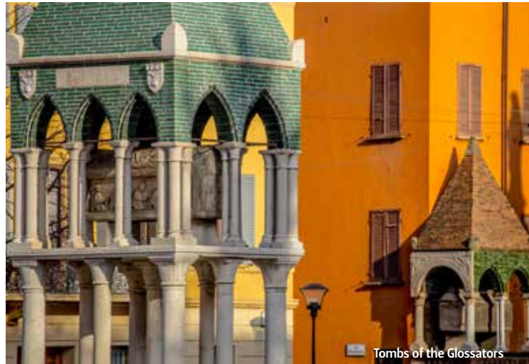
Tombs of the Glossators

The "glossators", legal scholars belonging to the school of Bologna founded by Irnerius in the 11 th -century, took their title from the literary term for their scholarly activity: attaching to texts of canon law and civil law annotations, known as "glosses", to clarify the meaning of the text. Through their detailed and extensive studies, the glossators not only mastered the ancient Corpus Juris Civilis of Justinian but also rendered it applicable to the legal life of their own day. These legal scholars enjoyed considerable social prestige in Bologna, as can be seen from the tombs located in some central squares: those of Foscherari and Rolandino Passeggeri in Piazza S. Domenico and those of the glossator Accursio and his son Francesco, the jurist Odofredo and Rolandino in Piazza S. Francesco.