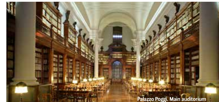
Palazzo Poggi. Main auditorium