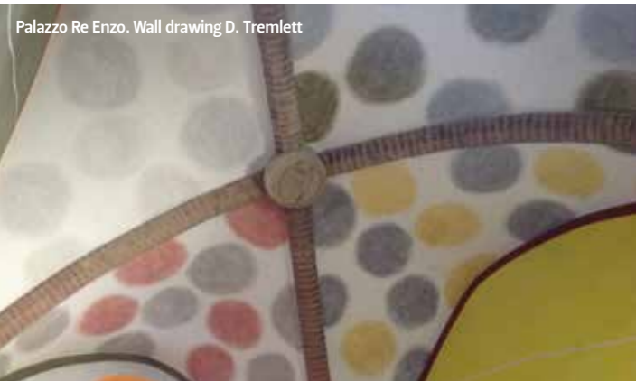
Palazzo Re Enzo. Wall drawing D. Tremlett

The chapel of Santa Maria dei Carcerati (Chapel of Saint Mary of Prisoners) was built in 1371 as a spiritual shelter for prisoners sentenced to death. Inside the chapel a big wall drawing was made in 2003 by the English artist (1945), who became world-famous thanks to this particular expressive medium: the pastel wall drawing technique enables to cover huge surfaces through pigments, applied by hand. Thanks to coloured powders it is possible to paint large spaces with small quantities. The artist, fascinated by the bare simplicity of the place and by its history, decided to respect the feeling of silence, preserving the suspended atmosphere of the chapel, that clashes with the clamour of the square.