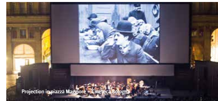
Projection in piazza Maggiore – Cineteca Bologna

and sulphur, when it had cooled it was polished in order to highlight the design obtained, black, dark or grey. In Hall 7 an English cope from the first half of the XIVth century is one of the rare examples in Italy of opus anglicanum , a type of embroidery made of silk and gold, produced in England since the XIIIth century. In the small niches there are scenes from the life of Christ and the Virgin and on the martyrdom of Thomas Becket. The client clearly intended to hint at the sovereignty of the papacy over that of the king. It was a pope, Benedict XI (1303–1304), who donated it to Bologna and more precisely to his brothers. In Hall 7 there is also a small portable Irish reliquary for private use, in the shape of a house, with a shoulder strap, in chiselled and golden bronze, vitreous paste and coral, from the VIII–IXth century. It was an Irish tradition to carry