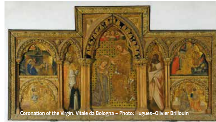
Coronation of the Virgin. Vitale da Bologna

one of the masterpieces of Vitale da Bologna, Saint Thomas Becket is portrayed in an episcopal dress while he invokes the protection on a monk at his feet. The prior, portrayed as a small figure, was probably not the real commissioner: there is a little figure next to Saint John the Baptist, probably a rich English student who worshipped Thomas Becket and who maybe felt the need to provide a decoration for the altar of the chapel.