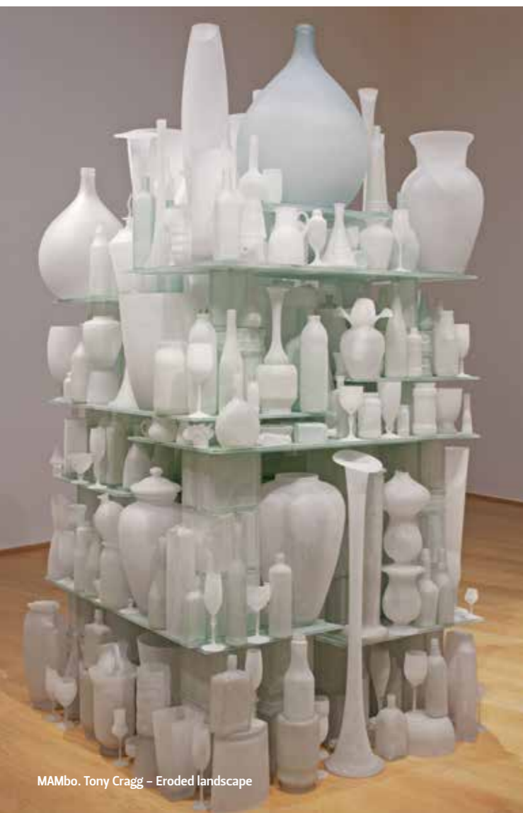
MAMbo. Tony Cragg – Eroded landscape

Since 1999 the Cineteca has worked at the restoration and diffusion of the work of Charlie Chaplin. This meticulous work, commissioned by Charlie Chaplin's heirs, consists in the complex restoration of his cinema work and in the digitalization and cataloguing of the paper archive. The official site of the on-line catalogue Charlie Chaplin Archive describes the whole artistic