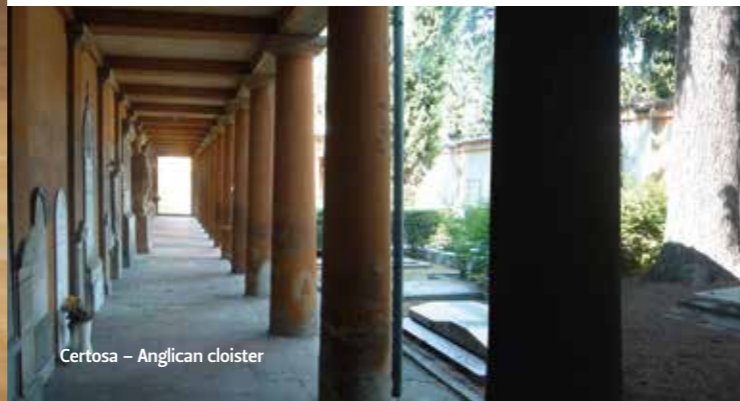
Certosa – Anglican cloister