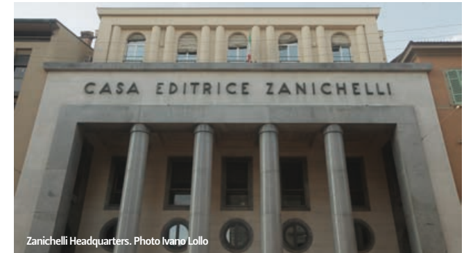
Zanichelli Headquarters.

From the quadrilateral shape of Piazza dei Martiri, with its central fountain, inaugurated in 1933, we proceed along Via dei Mille where, on the left-hand side, stands the old headquarters of ENPAS, the national welfare association for civil servants, (designed in 1956, inaugurated in 1963, architect Saverio Muratori) which was created from a critical and modern reworking of the Bologna's traditional style with portico and overhang. A slight detour along Via Capo di Lucca makes it possible to visit the controversial former Centrale dei Telefoni di Stato , or Telephone Exchange (1968–74 architect Enzo Zacchioli) a modern technological building which is seemingly isolated from the historical fabric, yet is in complete harmony with the area's industrial past. Then we encounter the spectacular Headquarters of the Zanichelli publishing house (1938 architect Luigi Veronesi) with its square shape and marble and granite cladding.