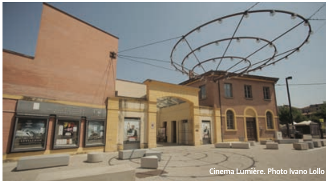
Cinema Lumière.

Since 2000 an intense project of urban regeneration, entrusted to architect Aldo Rossi, has involved the current Manifattura delle Arti , or Factory of Arts. The works have affected all the buildings and spaces that now make up the new Citadel of Art and Culture: the former Manifattura Tabacchi , tobacco factory (Via Riva di Reno 72), with its Art Nouveau façade, no longer houses industrial plants but instead accommodates the headquarters of the prestigious Film Archives and the digital restoration workshop. The 11 Settembre 2001 Park is a public area that is still bordered by the old walls of the former manufacturing plants. The Castellaccio district is used for university and public residences. The former Mulino Tambroni mill is now the University's Department of Media Sciences and the old Forno del Pane , or bakery, is currently the headquarters of MamBo , Bologna's Modern Art Museum. Cavaticcio park, created when the canal overlooked by the old port was reopened and the bridge that marked the boundary between two waterways reproduced, is enhanced by several pieces of contemporary art. Nowadays the former Salara , or salt store, is the headquarters of the LGBT community and cultural centre. The former Macello , or abattoir, houses the Cinema Lumière and the Renzo Renzi