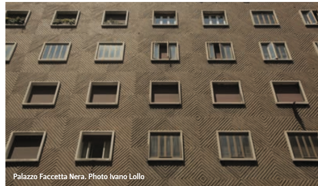
Palazzo Faccetta Nera.

In the nineteen thirties (1932–1936) the fascist administration completed the modern thoroughfare, initially named Via Roma, which was developed on the left-hand side with several buildings that reflected the modernist formalism of the time. Starting from the south and proceeding towards the railway station we encounter: the monumental concave facade of Palazzo del Gas on the corner of Via delle Lame (1935–36, architects Alberto Legnani and Luciano Petrucci) with its famous bas relief sculptured frieze