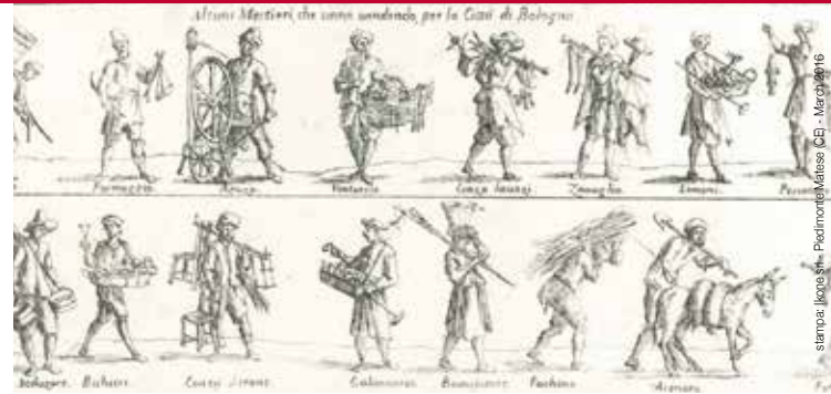
Art and History collection. Carisbo Foundation

Many workers of hemp ( canapa ), called canepini (or gargiolari ), that practiced their trade here gave the name to this district. The painter Guido Reni had his studio in this street in 1635 although the exact location is not known.